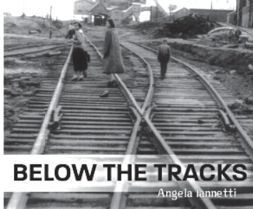
BELOW THE TRACKS

for our opening night Album Release, and Cape Breton Christmas Dinner Party. Every year I have a Cape Breton Christmas Dinner Party, where I cook up a storm of authentic Italian foods, salads, pastas, meats, poultry and desserts. This year, our dinner party had a little twist, as I released my new Album, "Below The Tracks". For the last two years, I have been working very