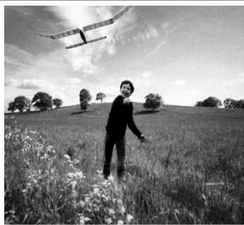
james blunt Who We Used To Be

Before Ed Sheeran there was James Blunt. I mention that for a number of reasons; they are friends, Ed is godfather to one of James's sons, Ed and James did some amazing performances together and this album, "Who We Used to Be", sounds so much like an Ed Sheeran album that you might be tempted to re-read who's name is on the cover. Not saying that Blunt is copying Sheeran, because Blunt released Sheeran-like songs almost a decade before Ed. There's a nice balanced tempo of songs here; some are dance numbers and some will elicit a tear or two (remember James's "Monsters" music video?) and that happens most with the beautiful song "The Girl That Never Was". It's about his wife's miscarriage, and imagining what could have been having picked out a baby name and knowing the sex. For me the best songs here are the amazing dance-oriented "Some Kind Of Beautiful" and "Beside You". That EDM vibe continues on "Cold Shoul-